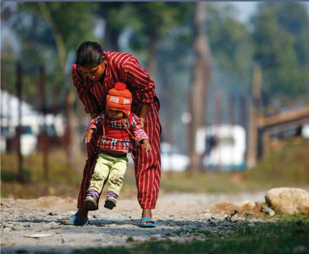
A former Maoist rebel walks with her child inside Shaktikhor Maoist Camp in Chitwan, Nepal. Many female Maoists face significant challenges to reintegrate into their communities, due to the fact that their participation in the conflict required them to break with traditional gender norms

As a complement to these efforts, the government of Nepal is trying to increase women's access to land by lowering the taxation on land registered under the name of a female family member. However, this has not been met with much success as many groups oppose women's land rights based on the fear of losing their traditional farming areas through the transfer of land rights via marriages. Further, in the complex post-conflict political environment, women's rights have also often lost momentum to "more pressing" issues. Despite these challenges however, some of the former female combatants are using the post-conflict social turmoil as an opportunity to act as ambassadors for gender equality in their communities, advocating for a change in repressive gender norms.