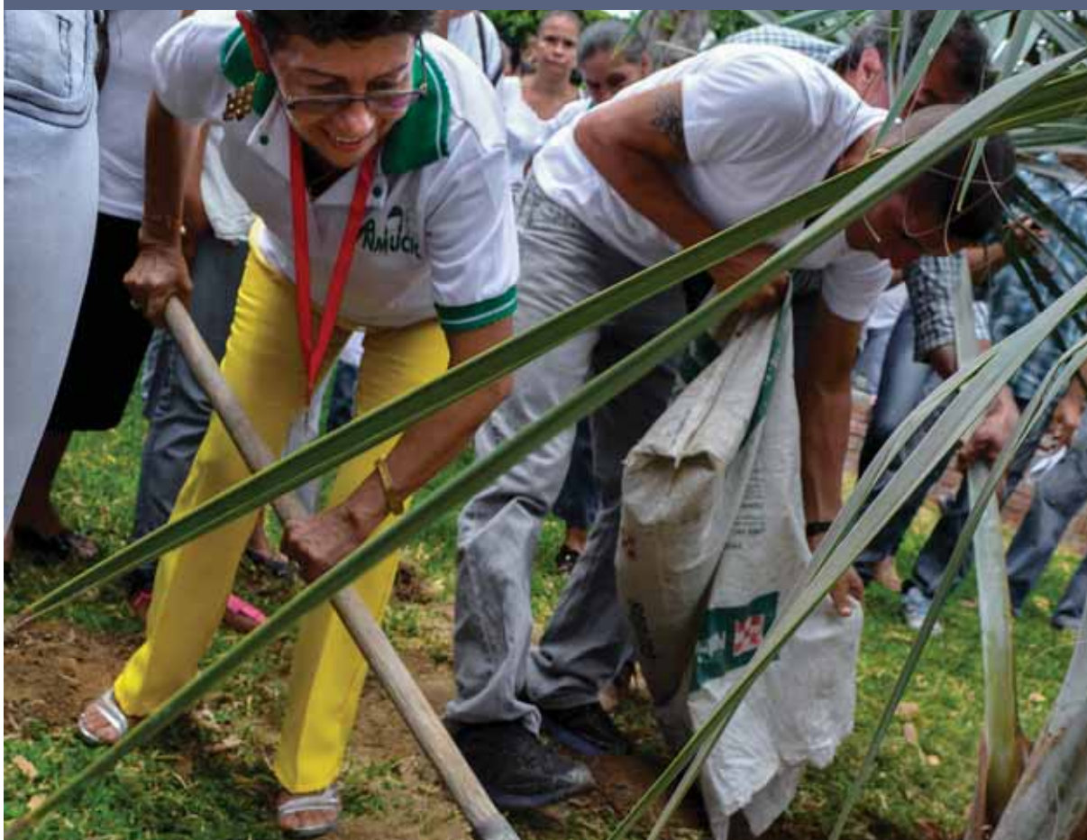
Members of the National Association of Rural, Afrocolombian and Indigenous Women of Colombia mark the beginning of a collective reparations process under the Victims and Land Restitution Act, which represents an important opportunity for returning land that was unlawfully taken during the conflict

In June 2011, Colombia ratified a Victims and Land Restitution Law (Law 1448/11) facilitating the restitution of land that was stolen or lost as a result of displacement during the conflict. Additionally, the law provides reparations for victims of conflict-related human rights abuses. 199 Under the new law, the members of ANMUCIC are eligible for collective reparations for being dispossessed of their land, as well as for the threats, killings and forced displacement that they endured. With support from the Colombian Special Administrative Unit for the Attention and Comprehensive Reparation of Victims and the Norwegian Refugee Council, the Association has been able to make progress on the identification of damages it has suffered as a result of the conflict. 200 Ensuring that the ANMUCIC women are successful in claiming reparations that sufficiently reflect the damage they suffered in terms of violence and lost livelihood opportunities would be an important benchmark for enforcing the rights guaranteed by the new law to the most vulnerable groups. If successful in accessing reparations for its members, the case of ANMUCIC in Norte de Santander could provide a positive legal precedent for other groups of women in similar situations. 201