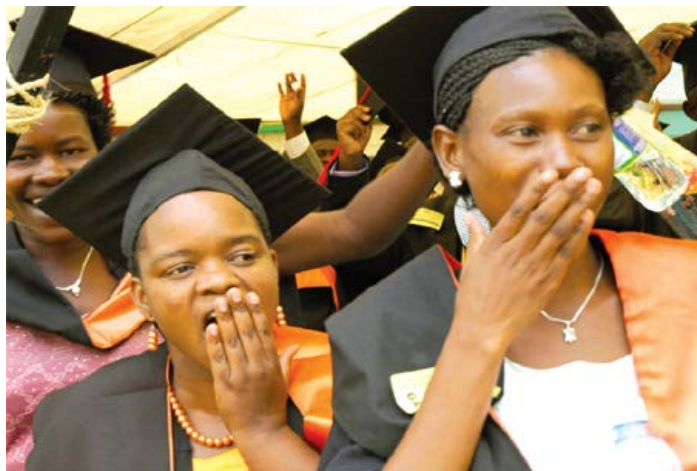
Women's increased access to education has power relations at all levels

On Wednesday, the New Vision reported in its lead story that "the Government is to issue ownership certificates to customary land owners ... which is intended to give people more control over their land ..." This news simply made my day.