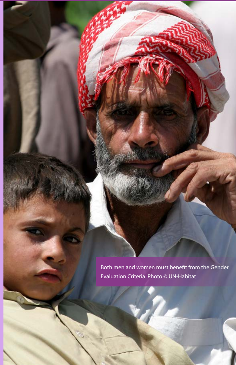
Both men and women must benefit from the Gender Evaluation Criteria.